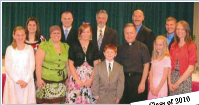
Class of 2010