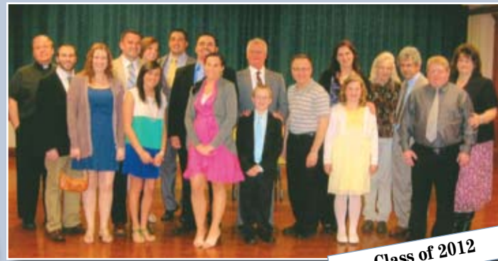
Class of 2012