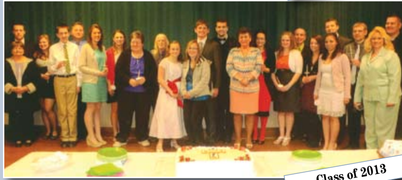
Class of 2013