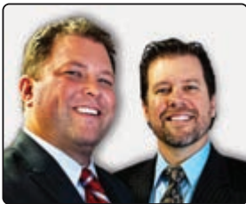
Call Jeff & Zig Today for your FREE CONSULTATION