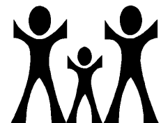
St. Joachim and Ann, parents of Mary